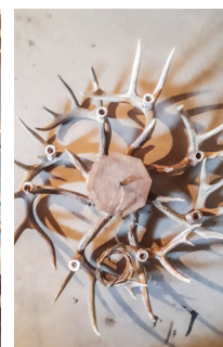
1 single-tiered WT chandelier $750.00