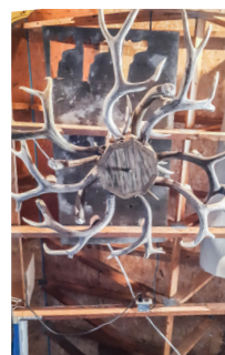
2 single-tiered MD chandeliers $750.00